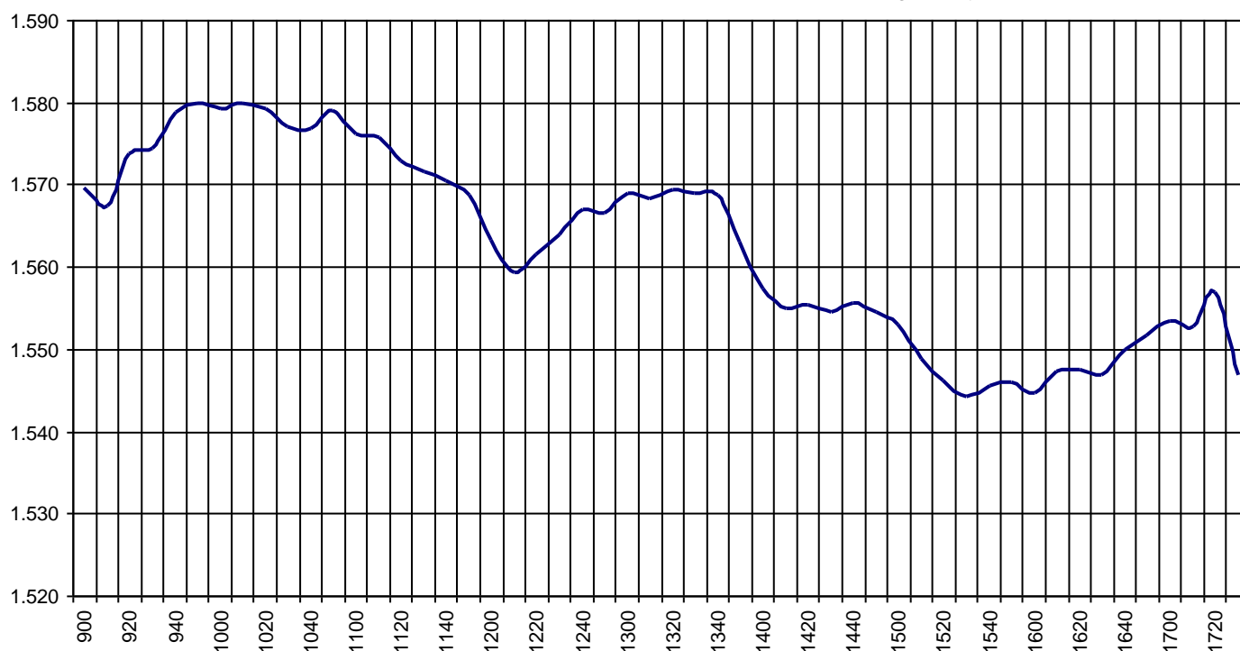
Valor medio del índice IBEX MAB® All Share cada 10' (Index Average every 10')