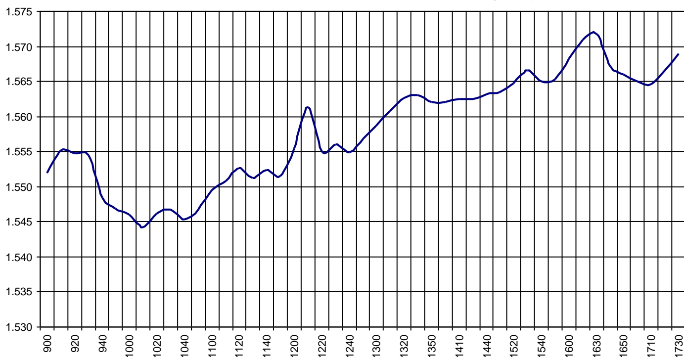
Valor medio del índice IBEX MAB® All Share cada 10' (Index Average every 10')