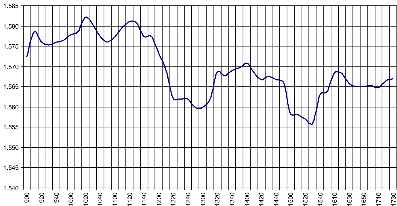
Valor medio del índice IBEX MAB® All Share cada 10' (Index Average every 10')