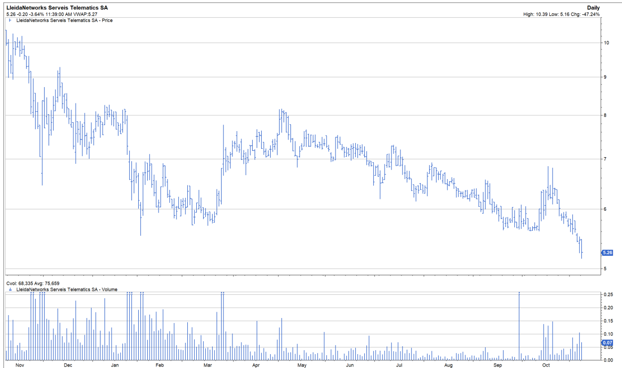
Figure 2 – Lleidanetworks Serveis Telematics SA – Trading in Madrid LTM